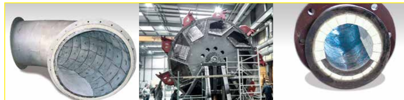
KALCAST and KALCRET Use in a shredder system for plastic waste